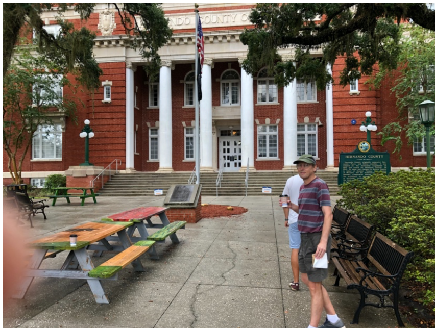
Stop 5 - Lunch in front of the Hernando County courthouse