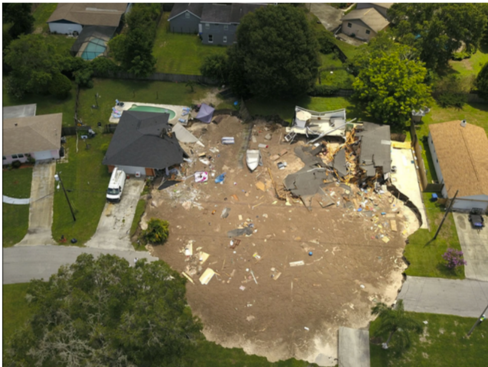
Stop 2 – aerial view of sinkhole in Pasco County, formed in July 2017.