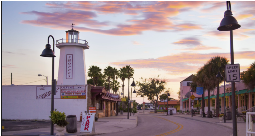
Stop 7 - Tarpon Springs. Once home to a thriving sponge business; strong Greek influence.