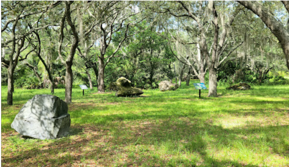
Stop 1 – USF Geopark – a sinkhole right on campus!

Below are some pictures illustrating field trip stops: